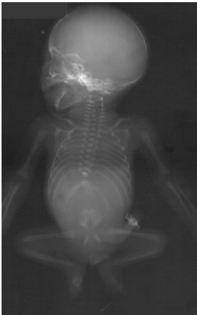
Figure 3 Antero-posterior radiographic view, showing missing ribs, absent lumbosacral vertebrae, hypoplastic pelvis and "frog-like" position of the lower extremities.

Orthopedic, gastrointestinal, genitourinary and cardiac anomalies are associated with caudal regression syndrome [11]. In our case club feet, flexion contractures of hips and knees, kyphoscoliosis and absence of ribs are the orthopedic deformities. A ventricular septal defect was the associated cardiac malformation [12].