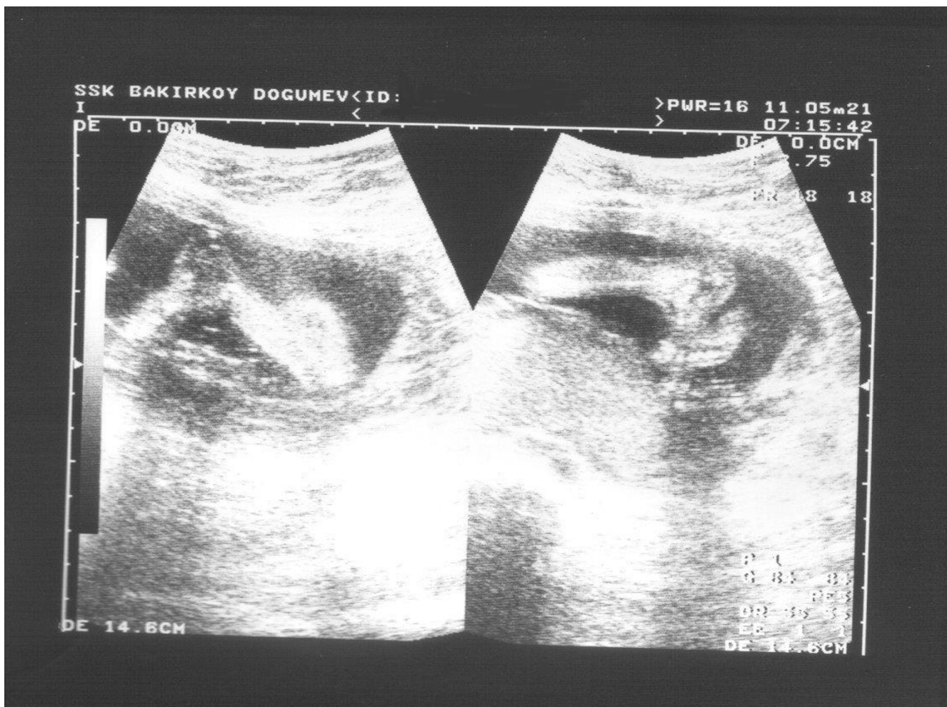
Figure 2 Note the "frog-like" position of lower extremities.

whereas during the early second trimester the amount of amniotic fluid may be sufficient to allow diagnosis. Early antenatal sonographic diagnosis is important in view of the dismal prognosis, and allows for earlier, less traumatic termination of pregnancy [5].